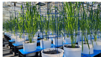
Photo 3: Early-season drought stress trial (NORDrOme) conducted at IPK, Gatersleben, Germany and funded by EPPN2020, ID: 498.