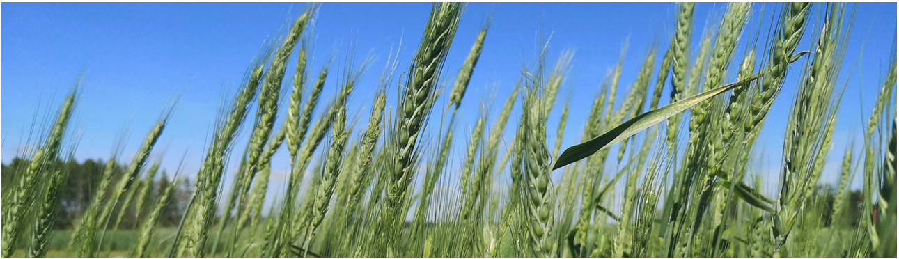
CResWheat field trial at Lantmännen, Sweden.