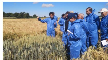
Field visit at the Global Rust Reference Center at Flakkebjerg, Denmark.