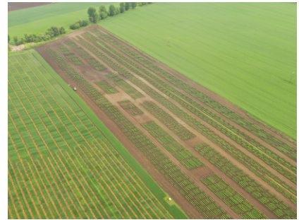
Graminor's field trails in Norwegian Bjørke.