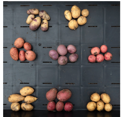
Nordic potato varieties.