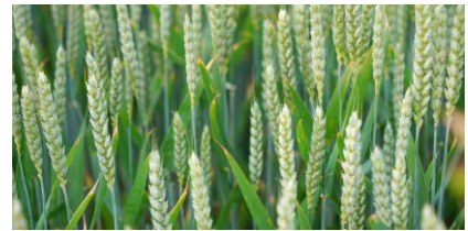
Spring wheat in field cultivation.

Top photo: Graminor's field trails in Norwegian Bjørke.