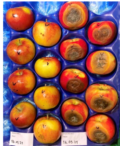
Development of fruit rot after inoculation with Colletotrichum acutatum . The cultivar 'Fonn' (MA992 35005 – two rows at left) is less susceptible than the control cultivar 'Aroma Husabø' (two rows at right).