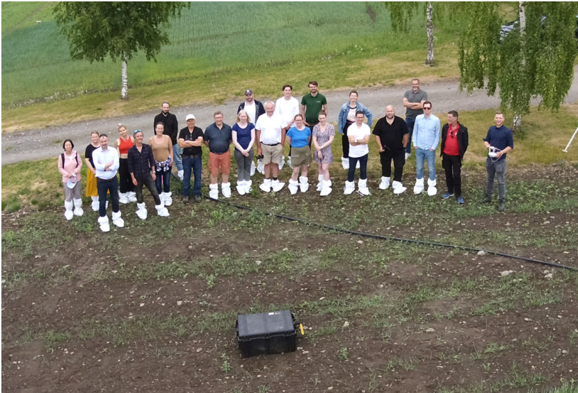
Group photo captured by drone during project activities. Photo 6P3 project.

In addition to research and development activities, since 2015, the 6P project has established networking activities, including an annual open symposium for colleagues from Nordic and Baltic countries interested in field phenotyping, featuring guest speakers from other countries. Additionally, there has been an annual field day hosted by the partners on a rotating basis. This has been carried out under the umbrella name of the Nordic Plant Phenotyping Network (NPPN).