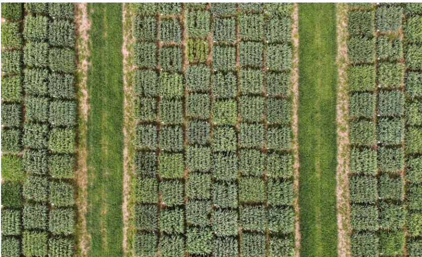
Drone photo of an oat field.

the 6P project contributed to significant and quick improvements to overall output and efficiency of current breeding strategies in barley, oats, wheat, ryegrass and potatoes in the Nordic region. Phase 2 of 6P transitioned research activities into breeder's field trials. Low cost UAV technology, coupled with available light-weight broad spectrum cameras, was successfully transferred into high-throughput phenotyping. An essential part has been automation of image management and processing with algorithms developed in the software platform PlotCut3, which extracts the data and integrates it into the GIS software, QGIS. This new method of data collection, storage, and investigation is enhancing the way Nordic plant breeders can consume and interpret information from field trials.