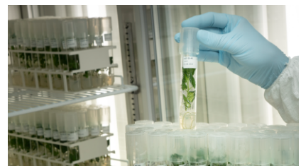
In vitro plant from the Nordic potato collection, conserved at NordGen.

Project partners have agreed to contribute a total of 261 different cultivars/breeding clones that represent each breeder, with each partner providing 87 unique varieties. Additionally, 15 common cultivars have been selected to serve as checks in field trials conducted by SLU, Danespo, and Graminor. This approach will facilitate robust statistical analysis and enable data linkage