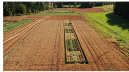
Disease nursery at LUKE, Finland.